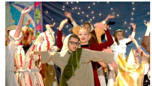
Resurrection Players Impacts Community with Youth Musical Theater